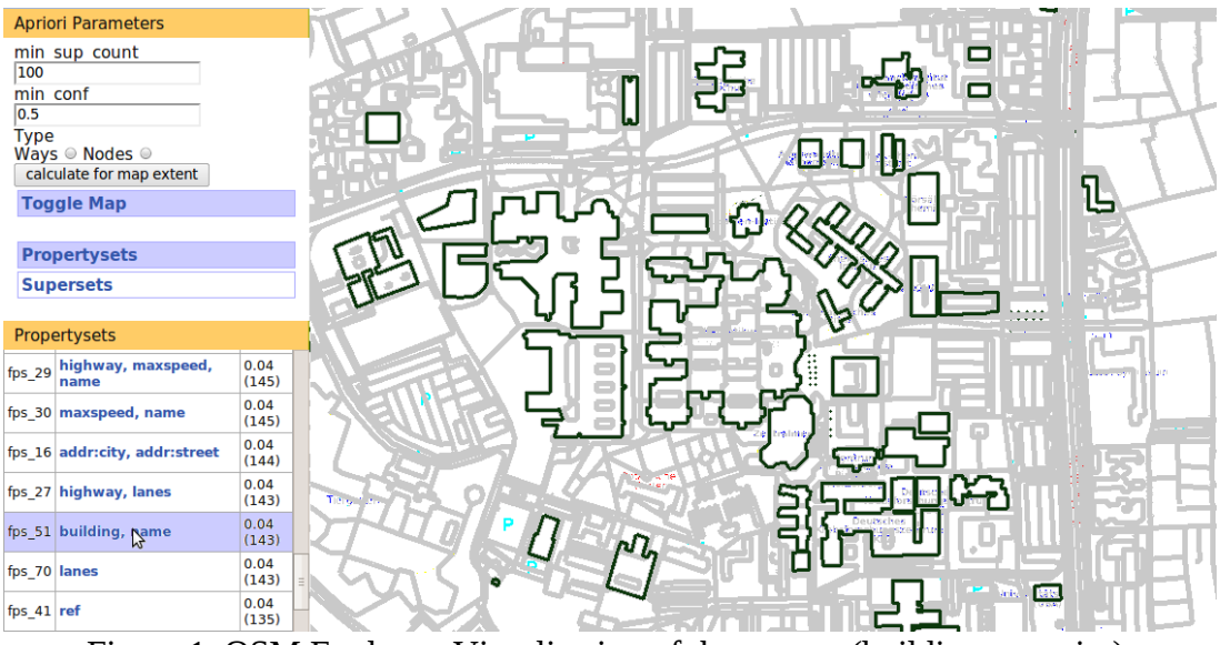
Figure 1. OSM Explorer: Visualization of the pattern (building, amenity).